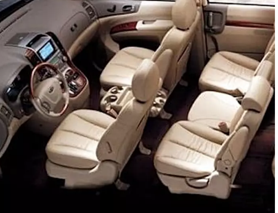
This Year's Kia Lineup Is Turning Heads -- And Finally On Sale! Best Kia Deals | Search Ads