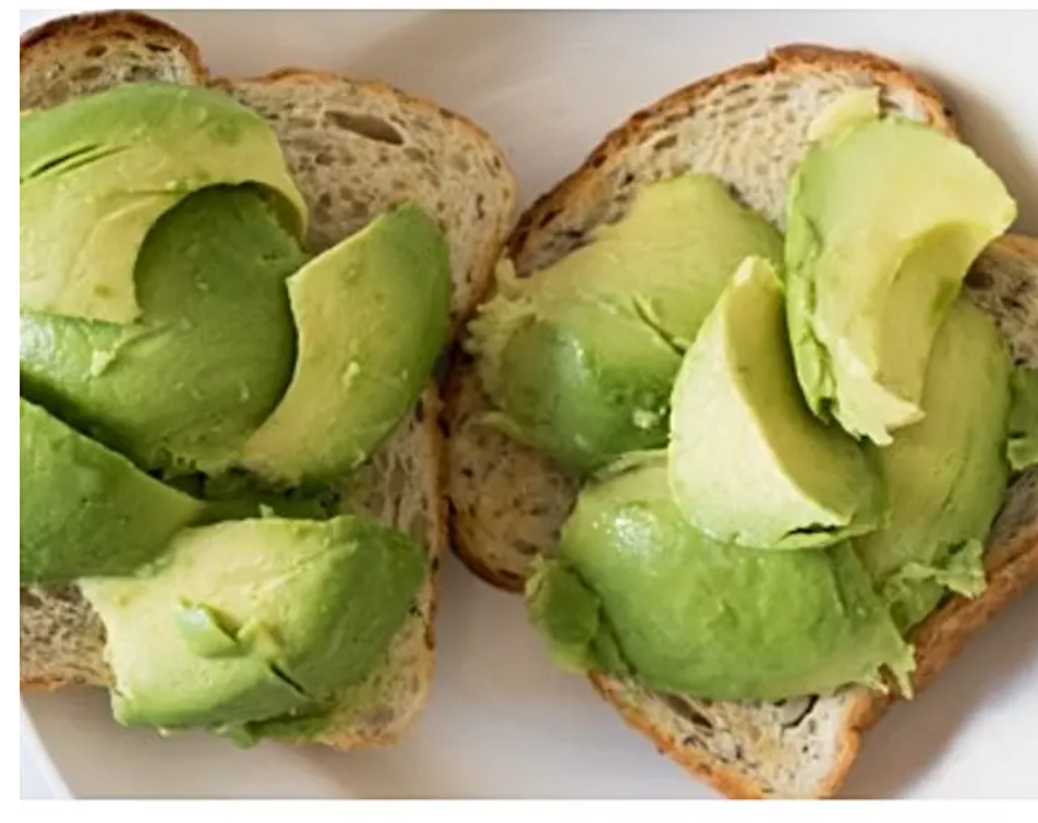
When You Eat Avocado Every Day, This Is What