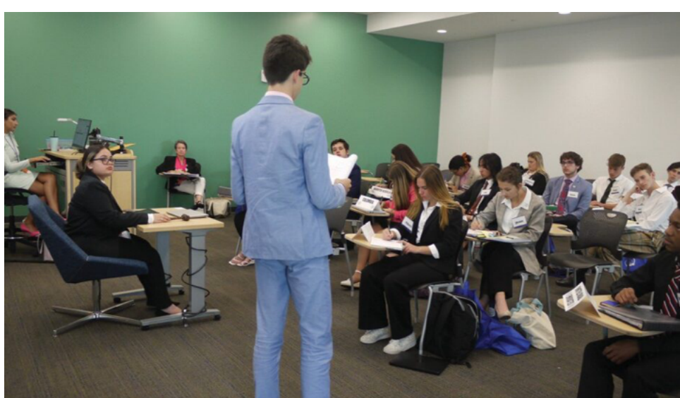
Southwest Florida Model UN offers real opportunities