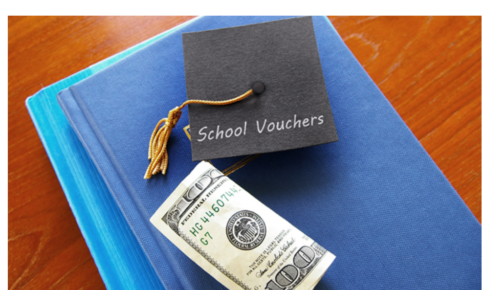
Florida House passes major school voucher expansion