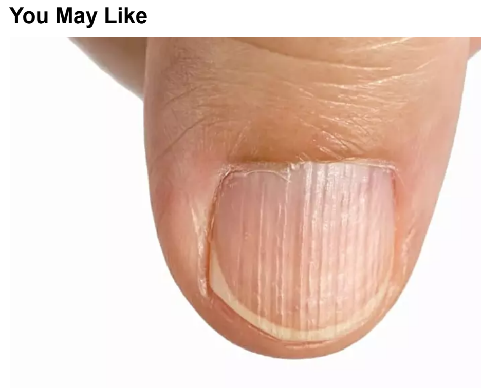
Warning Signs of Psoriatic Arthritis Most People Are Unaware Of