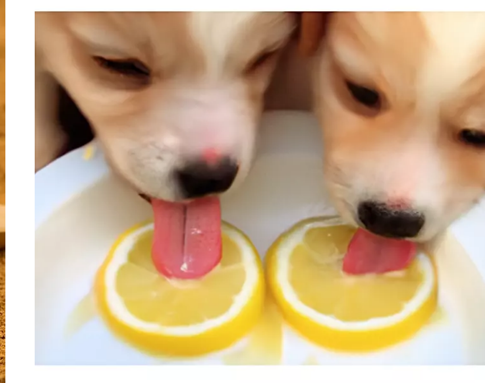
If Your Dog Eats Dry Food (Most Dog Owners Don't Know This)